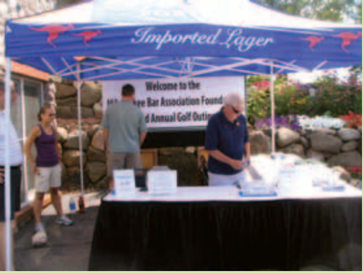
Waiting anxiously for that first customer: Staff and volunteers prepare for the 23rd Annual MBA Foundation Golf Outing. ↑